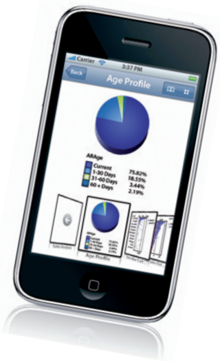
QlikView for iPhone

Fully-functional free QlikView Developer for Personal Use, and seeing is believing experience