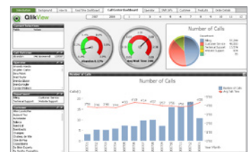
Visually rich, interactive dashboards

“With QlikView, I can analyze data in a way I could only dream about before.”